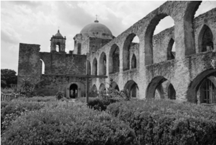
Mission San Jose